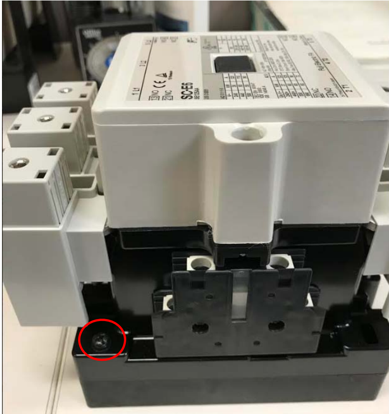
Top left side of contactor

Loosen screw (circled in red below) on both sides of contactor base